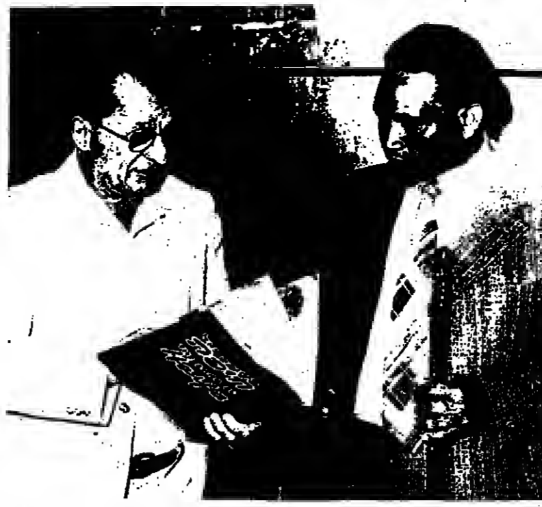
Haifa Mayor Arye Gurel presents Nairobi Mayor Andrew Ngumba with a copy of an album of photographs depicting the port city's history during a meeting the two had on Friday.

Foreign Minister Dayan and Deputy Premier Yadin were less sweeping (and much less sharp) in their criticism of several points in the Premier's proposal. But they, too, were openly uncomfortable with the sections providing for Israeli control over public and unutilized lands on the West Bank, and this issue will be resolved by the full cabinet when it meets tomorrow to consider this autonomy plan.